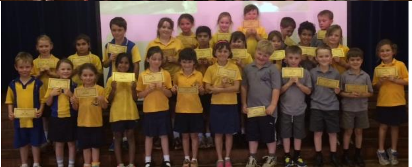
Bronze, Silver and Gold awards last week.