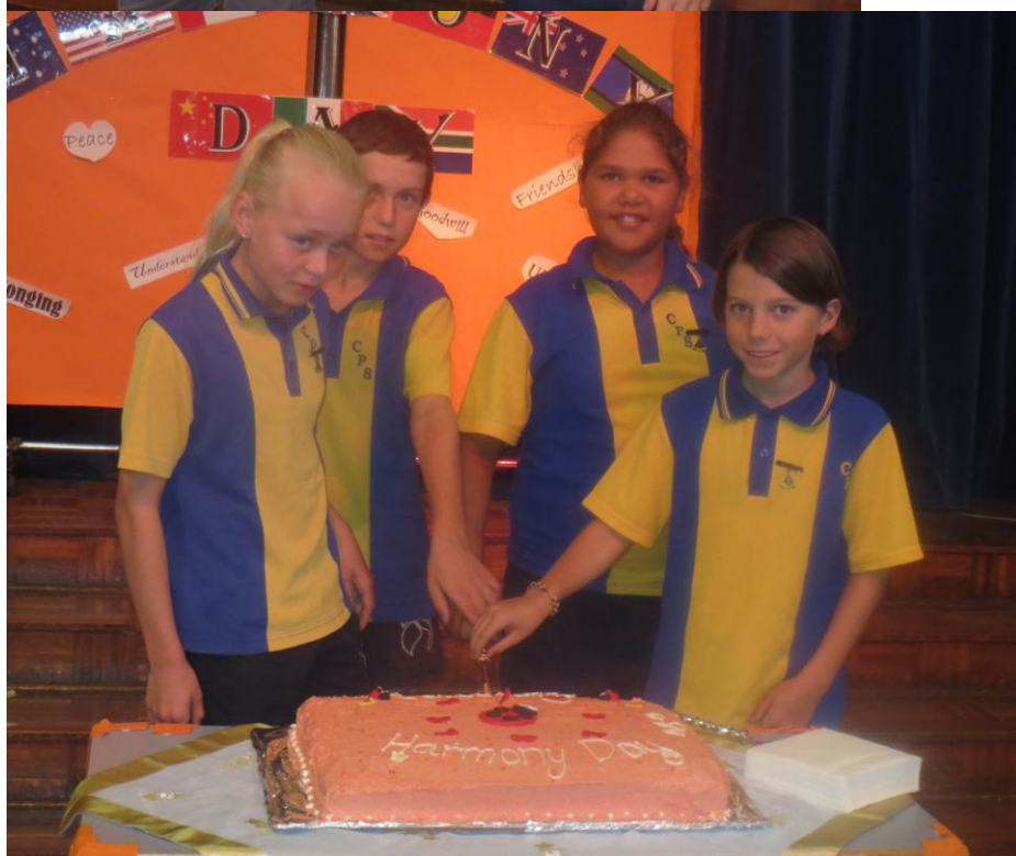
School Captains and Vice Captains cutting the Harmony Day Cake.