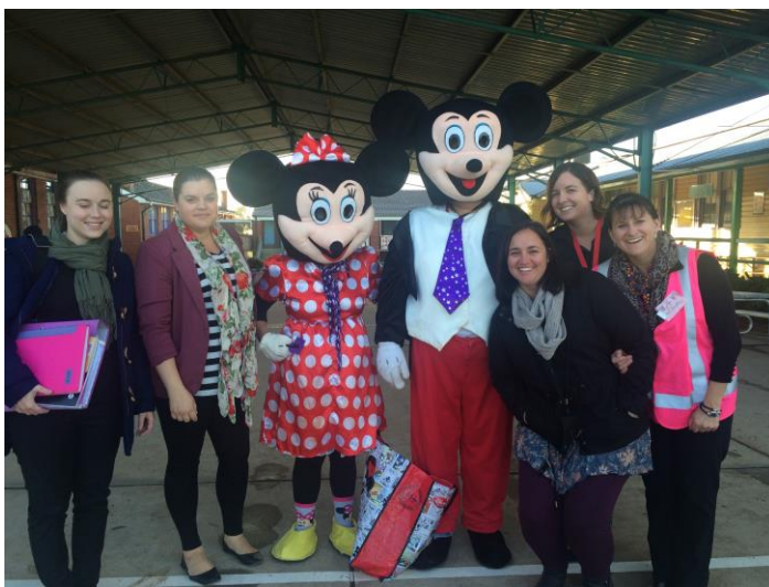
Variety Bash Visitors and Helicopter