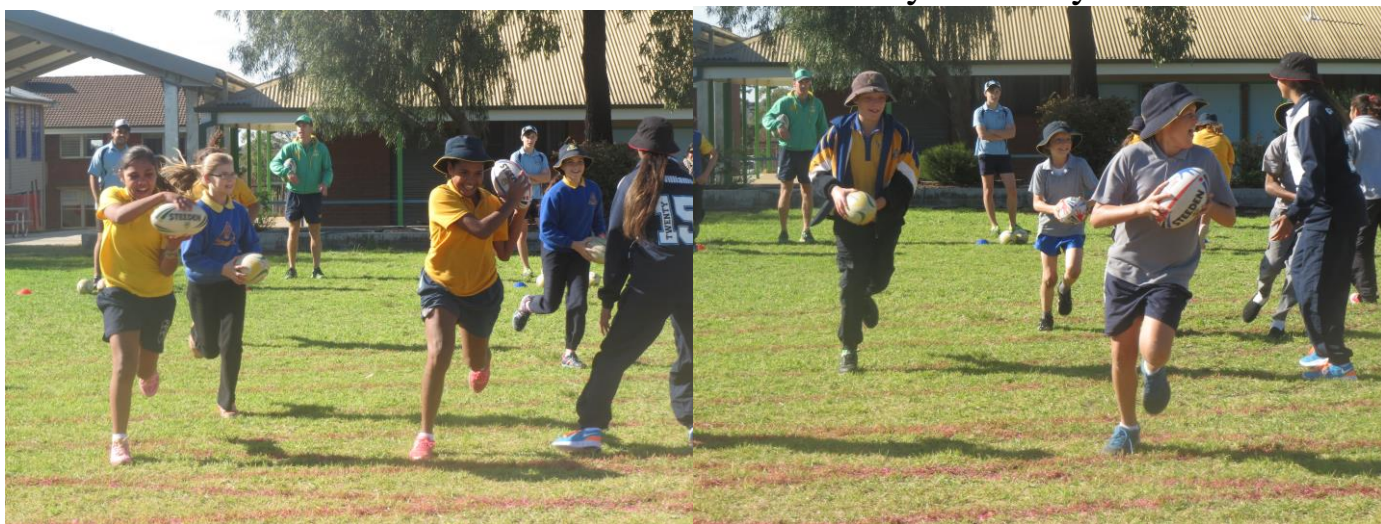
Students had lots of fun at the Backyard Footy