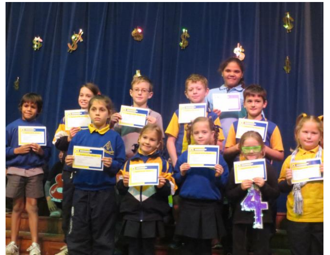
Merit Certificates & Student of the Month recipients