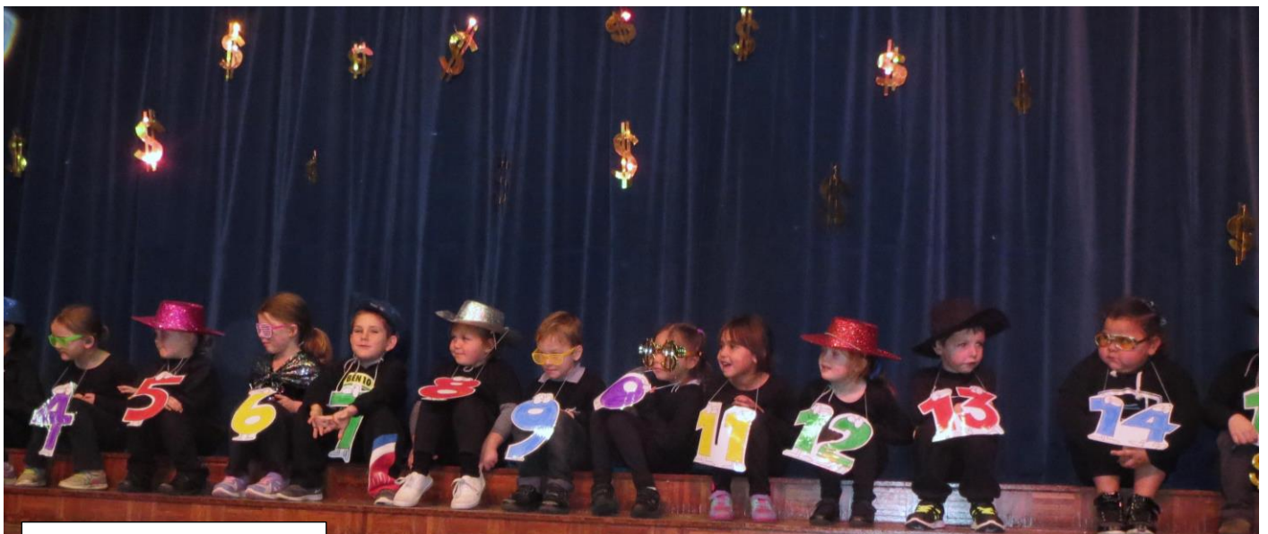
KR Formal Assembly