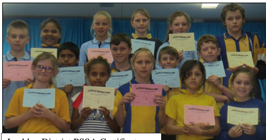
Lachlan District PSSA Certificates

As every child will be involved in their class photo, all children are expected to be in full uniform on this day.