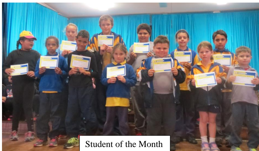
Student of the Month

Thank you to the teachers that have provided additional training sessions.