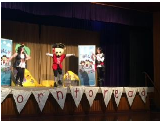
Students were entertained by Jolly Pirates

Here are some of the highlights of the event!