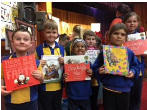
Condobolin Public School Prize Winners