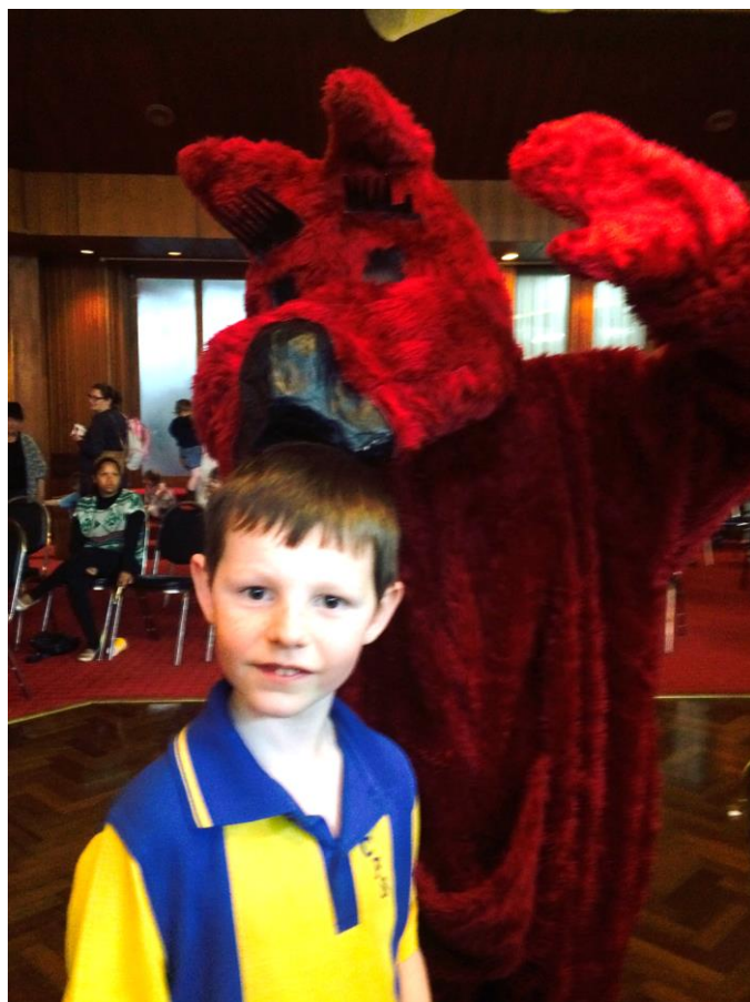
Born to Read Party.

Information was sent home Friday 11 September with students.