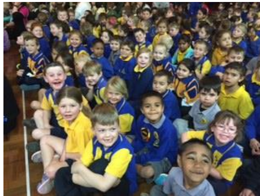
We are all having fun!