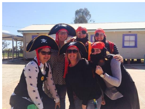
Here are some of our crazy K-2 teachers, just getting into the spirit of it!