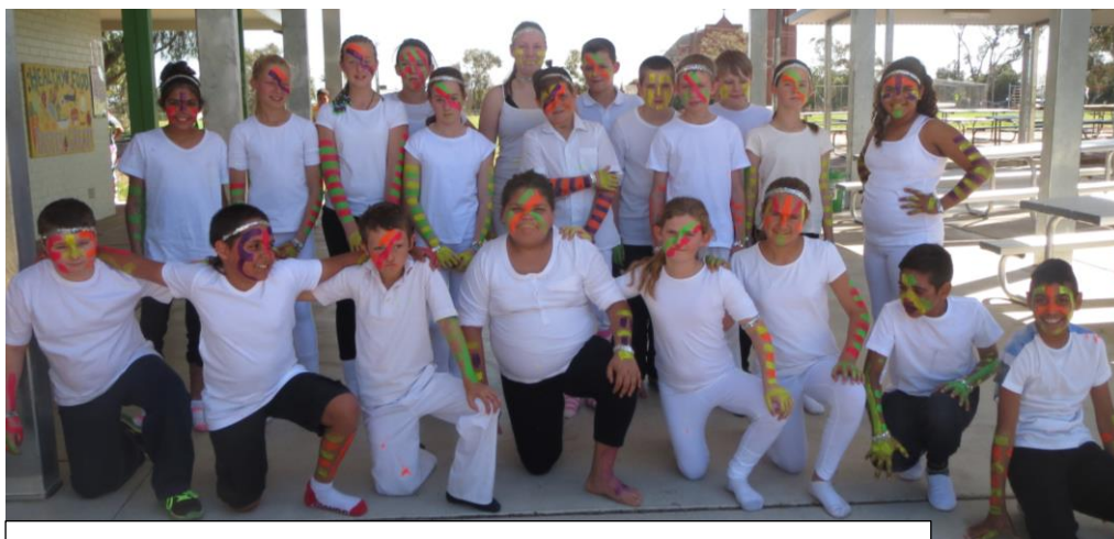
Class 5/6P ready for their performance at the Variety Concert

Thank you for taking the time to give us your feedback and help us make our school website even better.