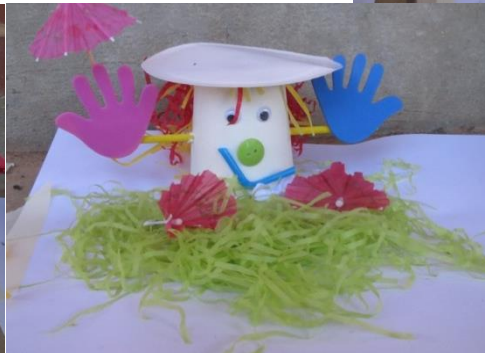
6R's interpretation of Cockington Green