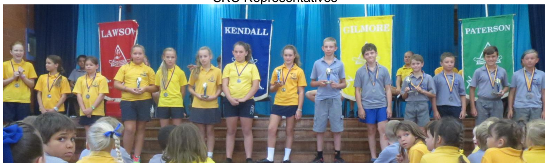
Swimming Champions and Runner Ups