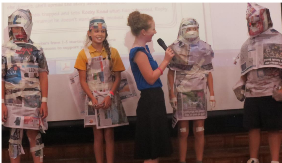
PEER SUPPORT TRAINING WAS CONDUCTED LAST TERM - LOOKS LIKE THEY HAD LOTS OF FUN.

Thank you to the vast majority our school community who show respect on a regular basis.