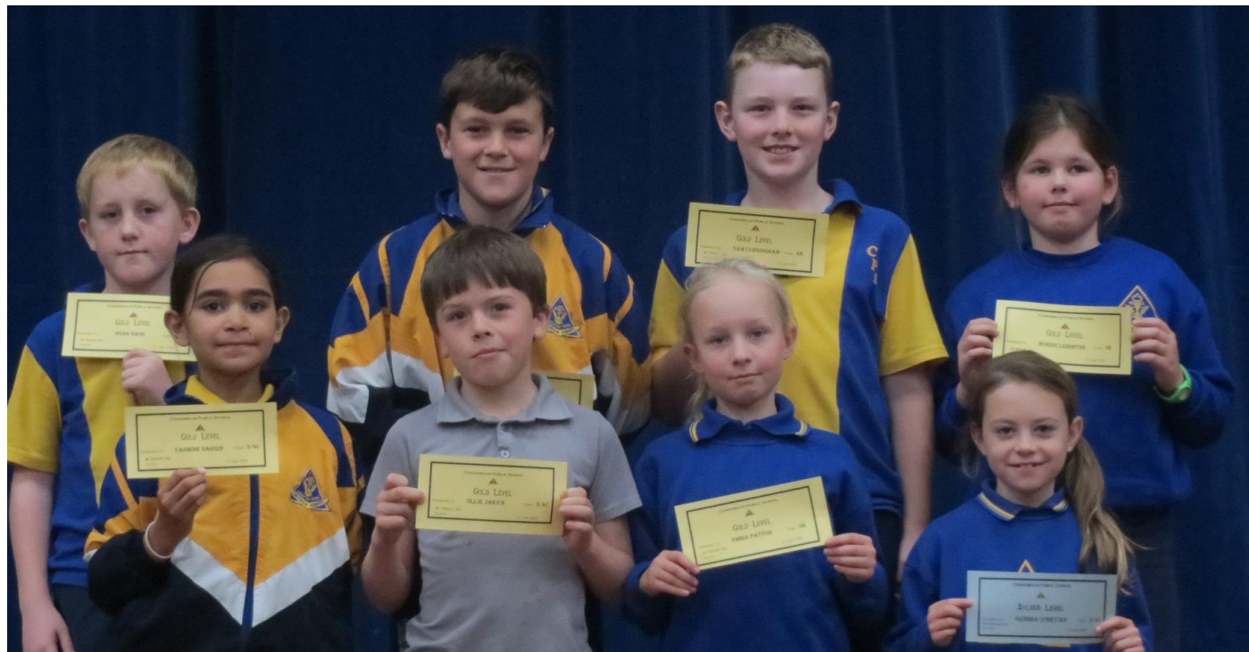
Our cross country representatives competed at Geurie - Congratulations