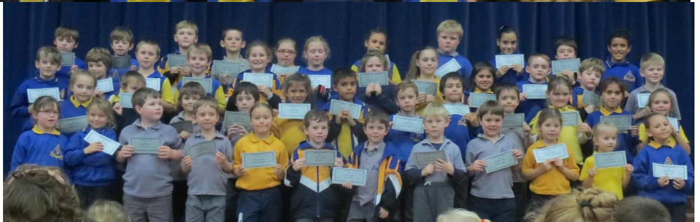
Bronze and Silver awards last week