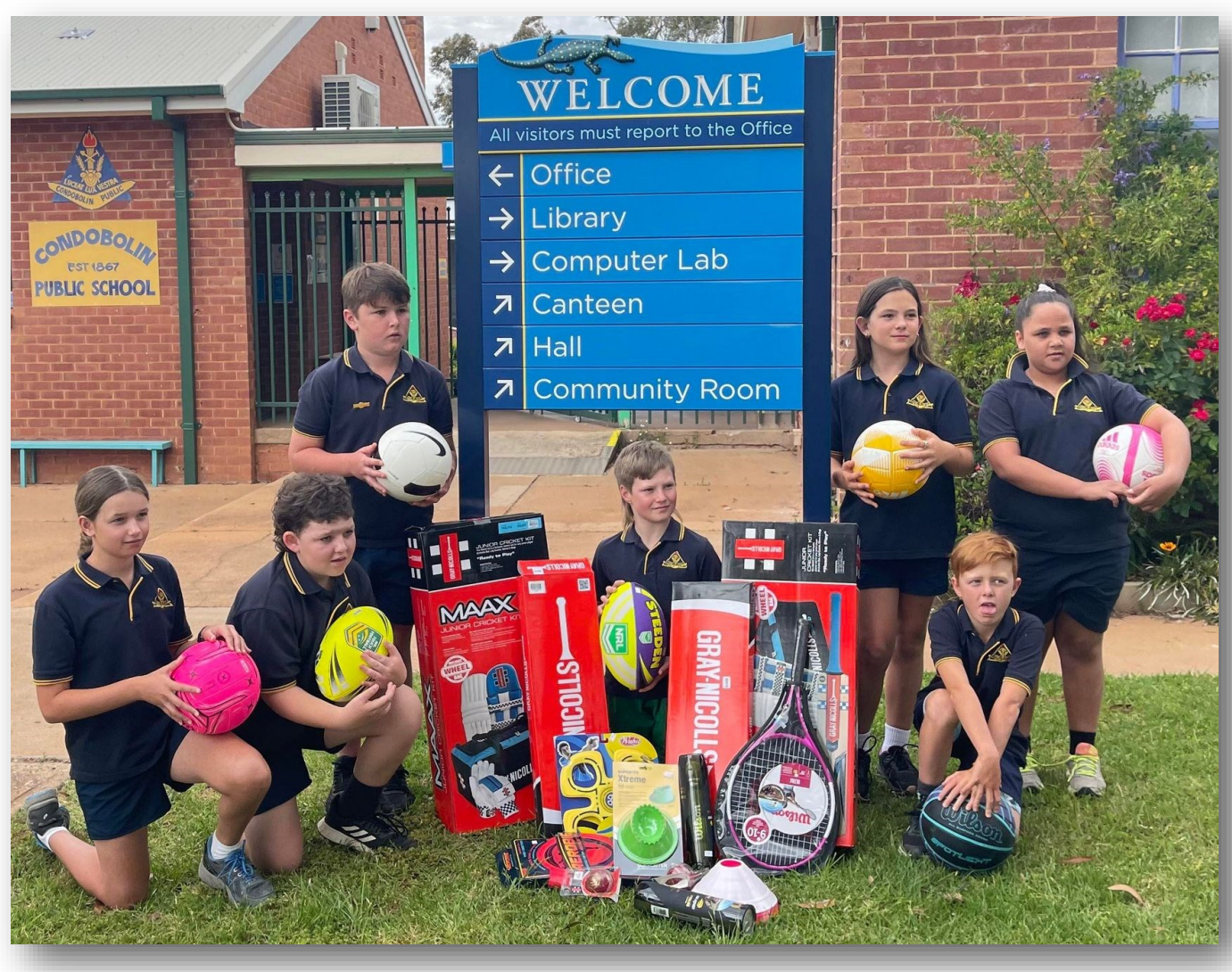
Our Junior Sports Captains accepting a kind donation from Inland Petroleum. Inland Petroleum have donated some amazing sports equipment . Thank you :)