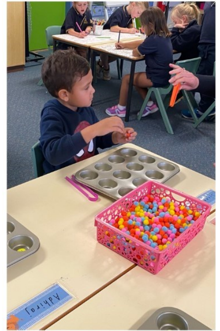
Last playgroup for 2021